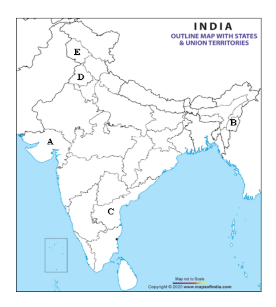
Note:- Following questions are for the visually impaired only, in lieu of question no 28