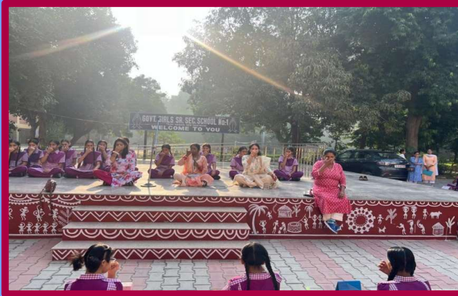
MEDITATION IN SCHOOL