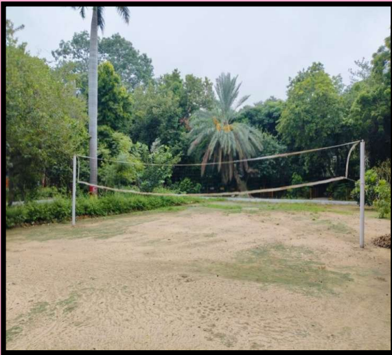
Volley Ball Court